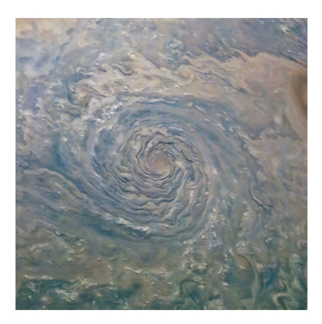
Caption: A giant storm in Jupiter's north polar region, captured by JunoCam on February 4, 2019. Image processing performed by citizen scientists Gerald Eichstädt and Seán Doran. Source: <u>bit.ly/JupiterSpiral</u>