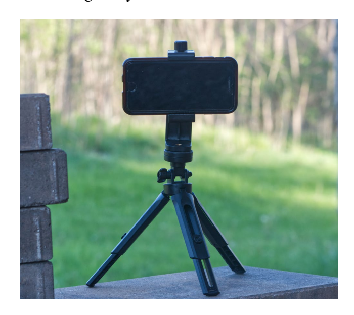
A small tripod for a smartphone. They are relatively inexpensive – the author found this at a local dollar store!