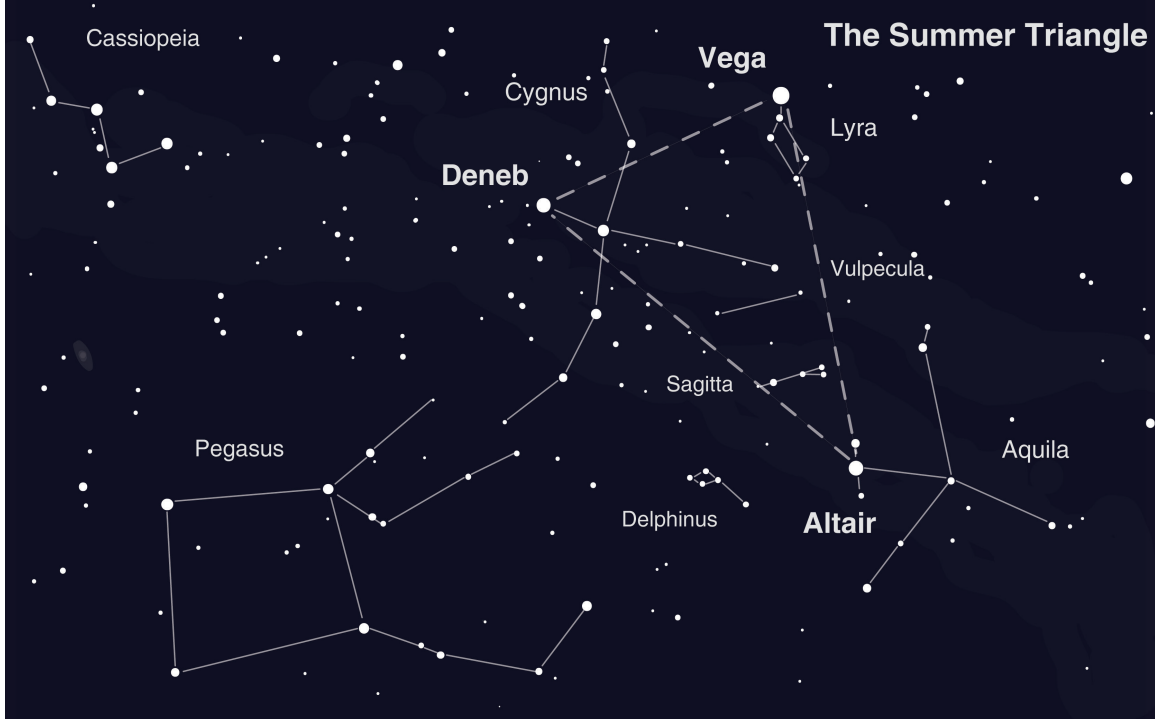
Caption : This wider view of the area around the Summer Triangle includes another nearby asterism: the Great Square of Pegasus.