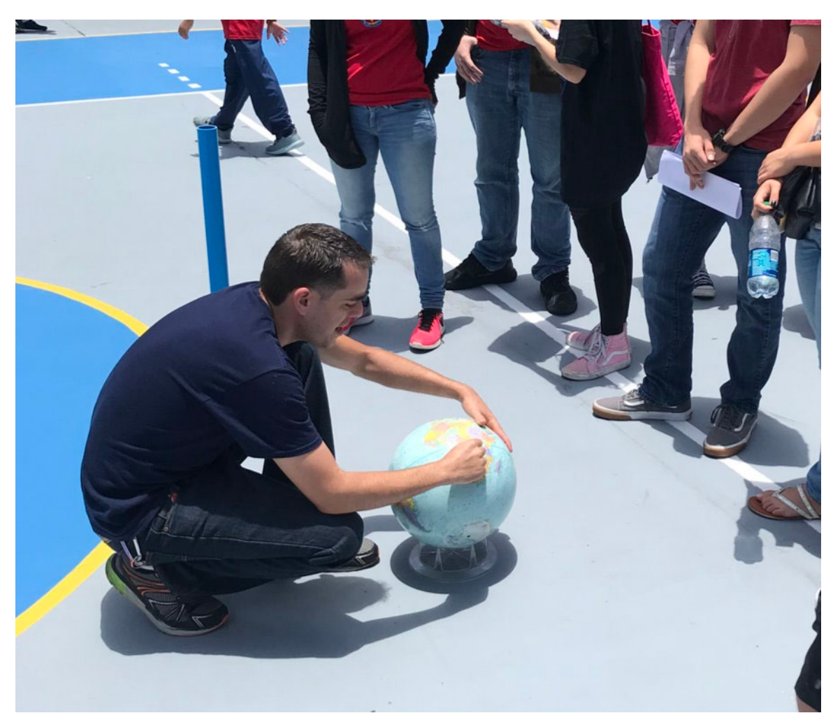
A presenter from the San Antonio Astronomy Club in Puerto Rico demonstrating some Earth-Sun geometry to a group during a "Zero Shadow Day" event. As Puerto Rico lies a few degrees south of the Tropic of Cancer, their two zero shadow days arrive just a few weeks before and after the June solstice. Globes are a handy and practical way to help visualize solstices and equinoxes for large outdoor groups, especially outdoors during sunny days!

Note to Editors: The images attached to March's "Embracing the Equinox" article can also be used with this article if desired, though slight updates to the captions might be desired to change to focus from equinox to solstice. You can find the archive at: <a href="https://nightsky.jpl.nasa.gov/docs/PartnerArticleMarch2022.zip">https://nightsky.jpl.nasa.gov/docs/PartnerArticleMarch2022.zip</a>